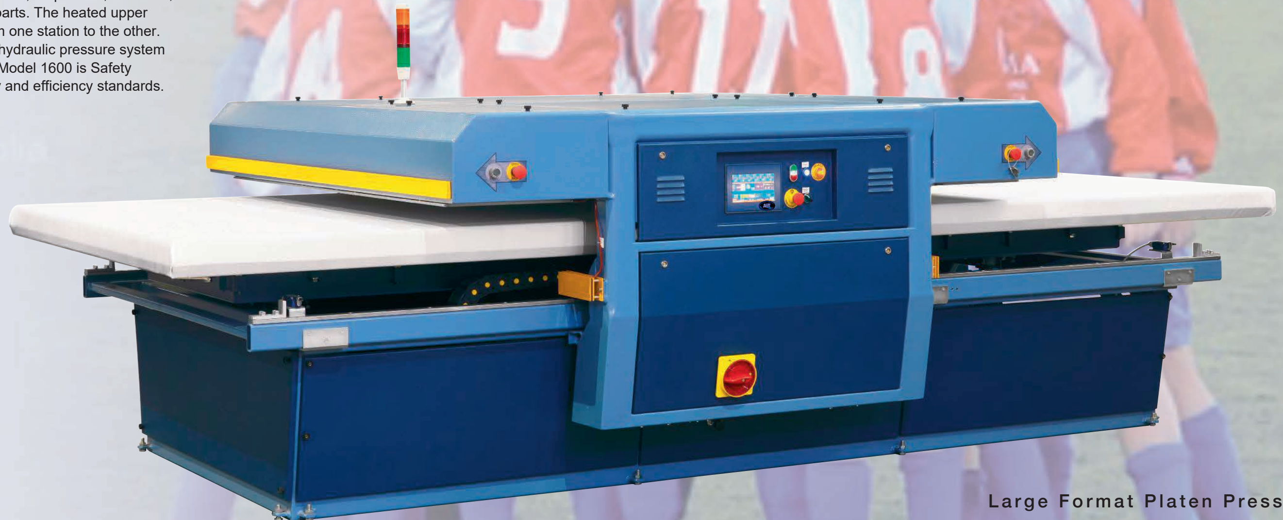
Large Format Platen Press

The AIT Model 1600 is a fully-automatic, large-format heat transfer printing system specifically designed for dye sublimation printing of flags, banners, carpet tiles, ceramics, wood, plastics, and cut-apparel parts. The heated upper platen automatically indexes from one station to the other. The multi-zone heat control and hydraulic pressure system provides consistent quality. The Model 1600 is Safety Certified and meets all EC safety and efficiency standards.